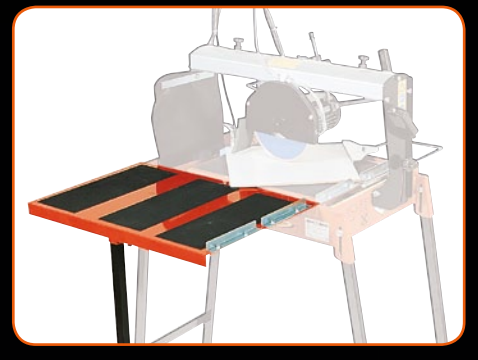
EXTENSION SIDE TABLE Very practical when cutting big tile sizes. (Optional: Art 85015)