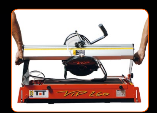
TRANSPORT Very easy to carry. Folding legs under the frame