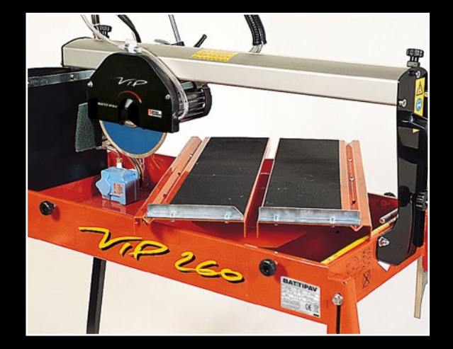
Easy to clean.