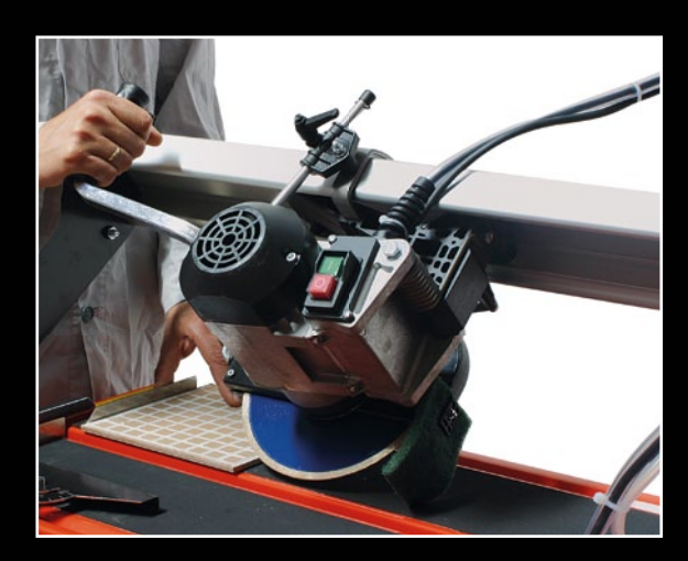
45° CUT Position 45° angle cuts.