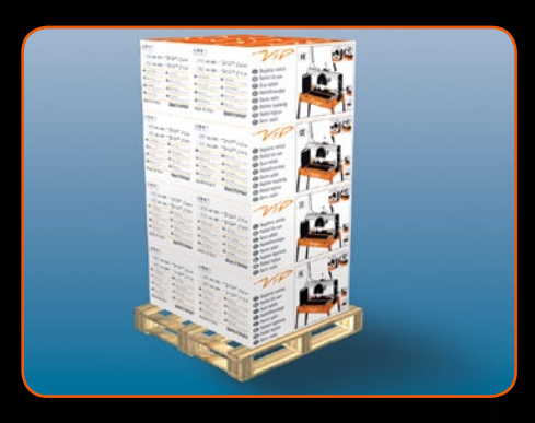
PACKAGING Multilingual flexographed packaging